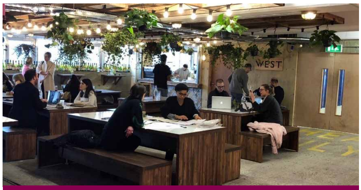
Peckham Levels, Southwark

Southwark Council transformed an underused multi-storey car park into a major cultural and creative hub and workspace which has led economic regeneration through the creation of over 450 jobs.