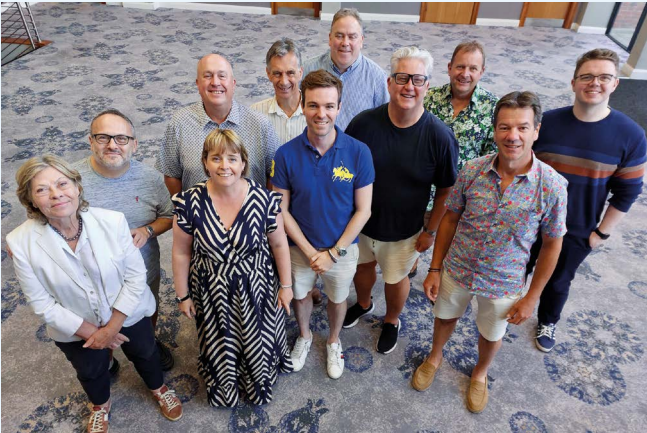
Members of the LGA Conservative Group Executive.

Leader of the Conservative Group Local Government Association