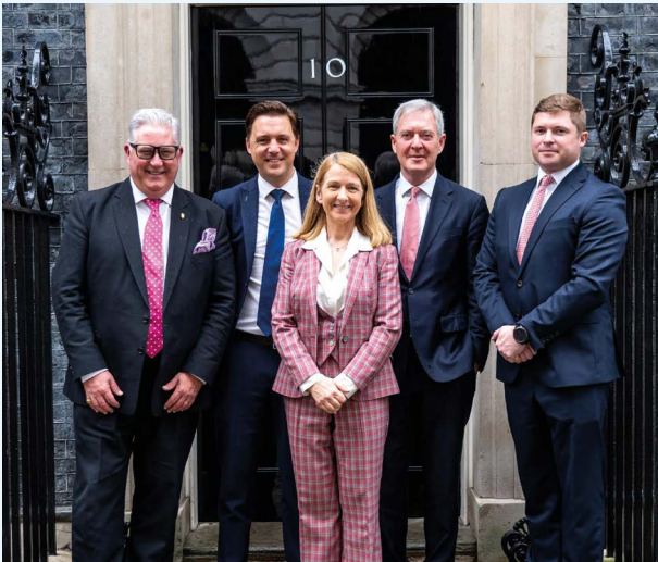
Leaders of the Conservative local government family attending a meeting of Political Cabinet in Downing Street under the last Conservative Government.