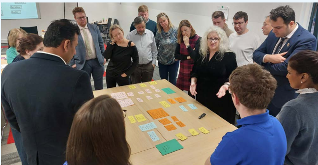
The last LGA Conservative Group next generation programme cohort – training the Council Leaders of the future.