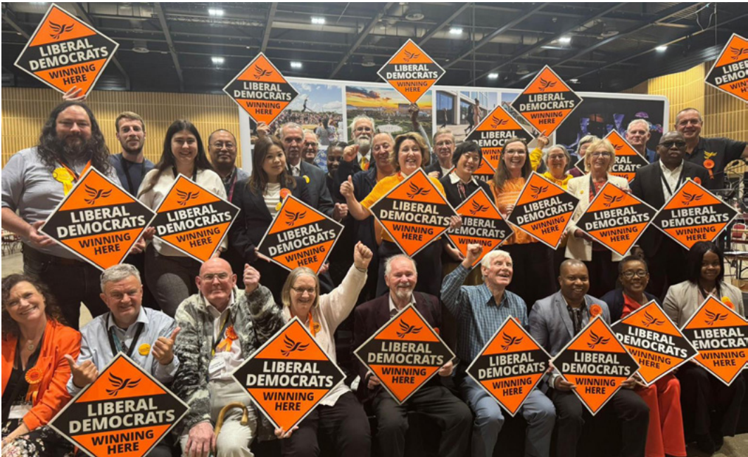
Liberal Democrats celebrate becoming the largest party on Milton Keynes Council

I look forward to fighting for Liberal Democrat values within the LGA at a time of rapid change both at the LGA and in the wider political environment.