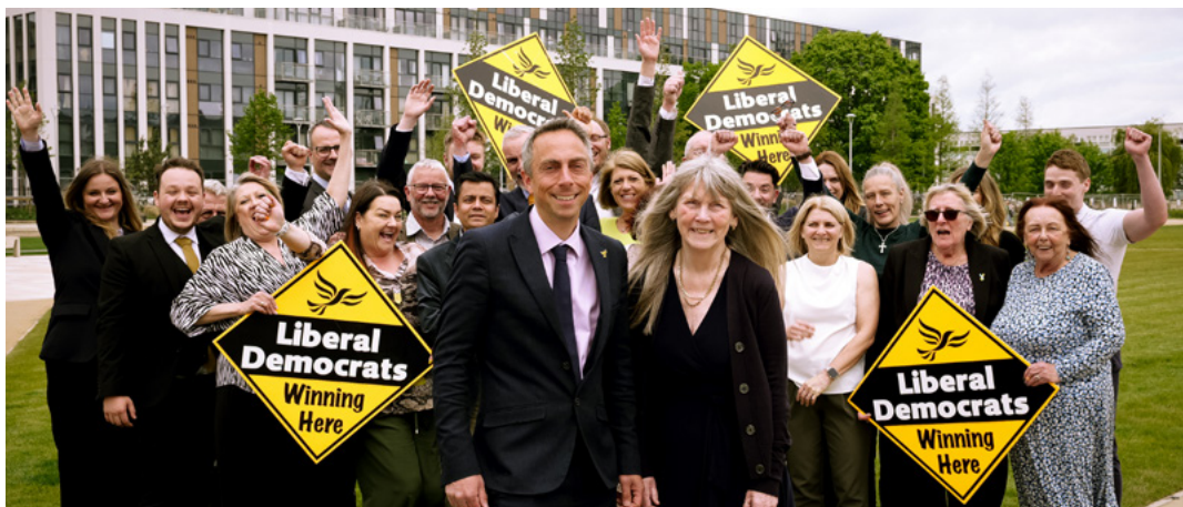
Liberal Democrats retained the leadership of Hull City Council